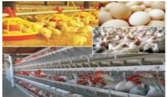
Fig.1 Poultry farming

farm through mobile or personal computer using internet.